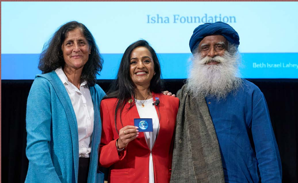
National Aeronautics and Space Administration (NASA) Commander Sunita Williams and Scientist Dr. Kavya Manyapu in Conversation with Sadhguru