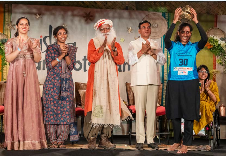
The grand finale was graced by distinguished guests, including Dr. Mansukh Mandaviya, Hon'ble Union Minister for Sports; Saina Nehwal, Olympic medalist & renowned badminton player; Bhavina Patel, international para table tennis champion; and Vaishali Rameshbabu, chess grandmaster.